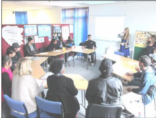
Emotional Eating Workshop

make calls with us on hand to support and help them through the initial stream of automated responses at call centres.