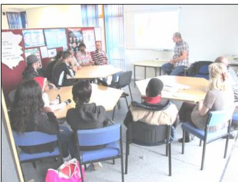
Well For Life Workshop

Courses provided in the last 18 months have included First Aid, Child Protection, Risk Assessment, Health & Safety, Creative Writing, Photography, Media, CV & Careers, Derbyshire Wildlife and Presentation Skills. These training workshops aid social integration and build confidence, preparing clients for the workplace and enabling them to share these skills with others. We plan to explore opportunities to help carers and victims of torture and abuse.