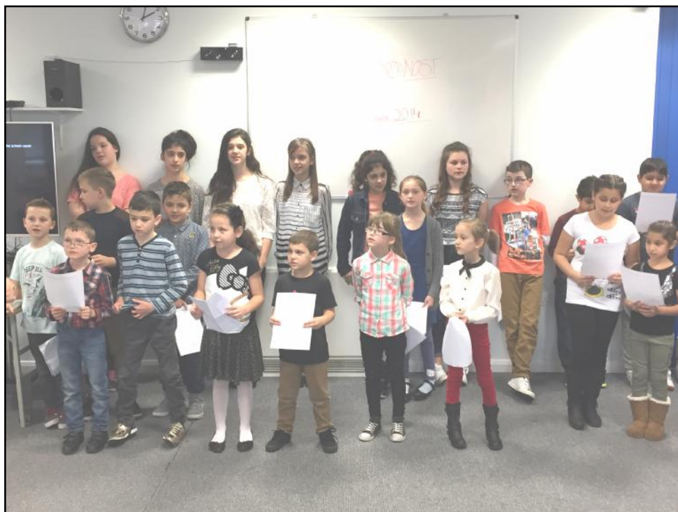
Učenici Bosansko-Hercegovacke Dopunske Skole upriličili bogat kulturno-zabavni program.

U Subotu, 22. Novembra 2014, u Bosansko-Hercegovackom Centru Derby, obilježen Dan Državnosti Bosne i Hercegovine.