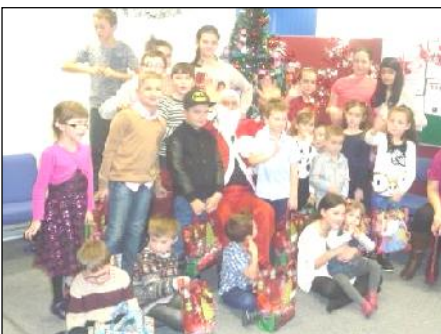
BiH Centar Derby, Decembar 2013